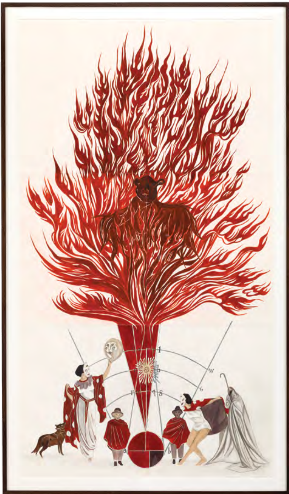
This spark will prove a raging fire, 2014. Watercolor, gouache, and graphite on paper. 6 part work. Framed: 55 1/8 x 32 1/4 x 1 inches. Overall: 51 3/4 x 28 1/2 inches. Each paper: 17 x 14 inches.

“The tricks of today are the truths of tomorrow.”