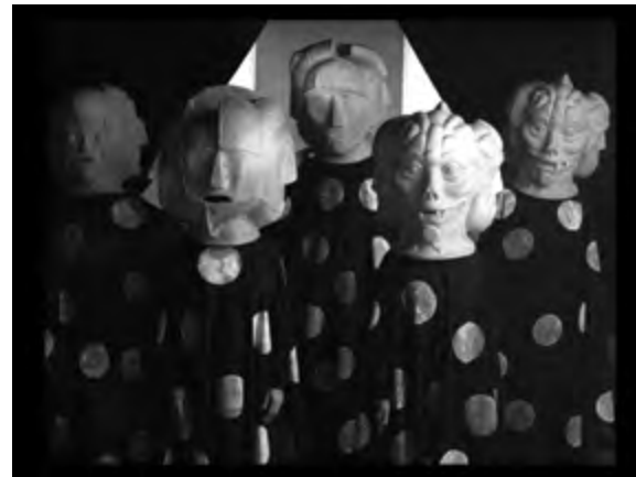
Une danse des bouffons (or A jester's dance) , 2013 Video projection, 35:22 min, black and white, sound Overall dimensions vary with each installation