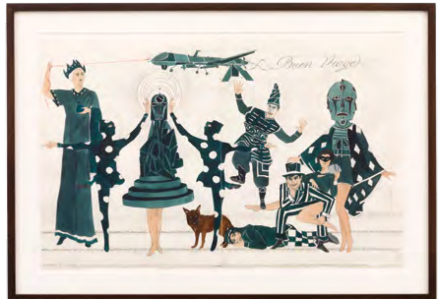
Too many nights and only one queen or Long knights for a lonely queen , 2014. Watercolor, gouache, and graphite on paper. Framed: 20 7/8 x 18 1/8 x 7/8 inches. Paper: 14 1/8 x 16 3/4 inches; Bon voyage or The punishment of pride , 2014. Watercolor, gouache, and graphite on paper. 2 part work. Framed: 18 1/8 x 26 1/8 x 1 inches. Overall: 14 x 22 inches. Each paper: 14 x 11 inches.