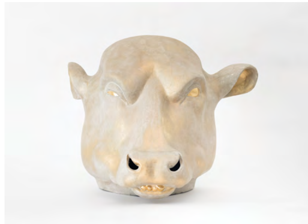
We three kings , 2014. Printed steel and spray paint. 18 1/2 x 9 1/2 x 10 1/2 inches. The red king's head , 2014. Printed steel and spray paint. 17 x 14 1/2 x 14 1/2 inches.