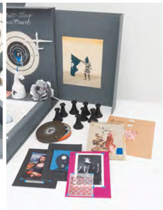
A blue box for Marcel , 2013. Fabric, acrylic, wood, plaster, metal, paper, vinyl, porcelain, film, plastic flower, graphite, collage, and string. Dimensions vary with installation. Assemblage: 26 x 52 x 31 inches. Box, closed: 5 1/2 x 17 1/2 x 19 5/8 inches. Box, open: 27 x 17 x 23 3/4 inches.