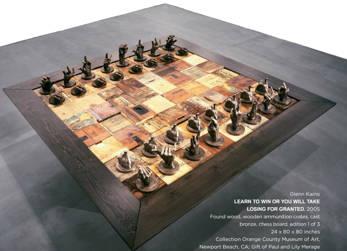
Glenn Kaino LEARN TO WIN OR YOU WILL TAKE LOSING FOR GRANTED , 2005 Found wood, wooden ammunition crates, cast bronze, chess board, edition 1 of 3 24 x 80 x 80 inches Collection Orange County Museum of Art, Newport Beach, CA; Gift of Paul and Lily Merage