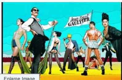
Enlarge Image © Jean Paul Gaultier/Brooklyn Museum Ad campaign for Gaultier's spring-summer 1992 collections.

fashion label threeASFOUR to create an exhibit mixing architecture, video and avant-garde couture (including pieces from the label's spring-summer 2014 line). To mark the September opening, around the time of New York fashion week, the Jewish Museum is staging its first major runway show.